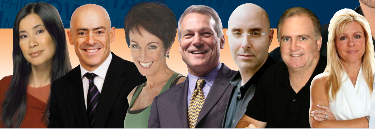
LISA LING MIKE LIPKIN TERESA TAPP PHIL TOWN MITCH JOEL SEAN & LEIGH ANNE TUOHY